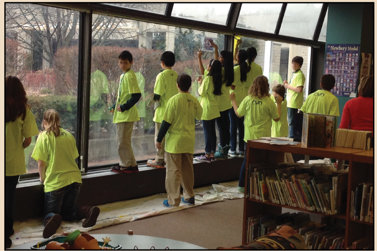
Six, 7 and 8 graders from ASMS paint the library windows with a spring theme.

This scholarship is the result of a very generous bequest by an anonymous donor.